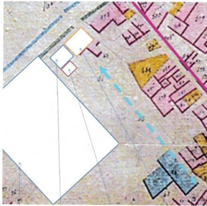
Château féodal, Maison de François de Laudun, Maison de Blaise Blaine sergent, L'église Sainte-Foy Emplacement probable de l'ancienne église de Sainte-Foy d'après les actes notariés.

The original castle on the hill of Ste Foy consisted of a keep and at least one storey accessed by a stone staircase. It was probably used as a dwelling and a watchtower.