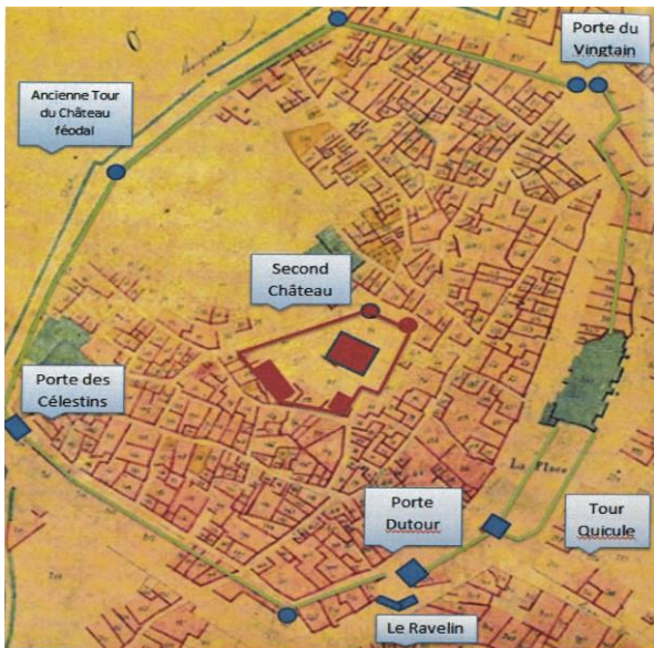
Les Remparts, les 8 tours, les 3 portes et le ravelin du bourg de Sainte-Foy. Au centre, le second château « le Castellias » avec ses deux tours

The ramparts around the town consisted of 8 towers.